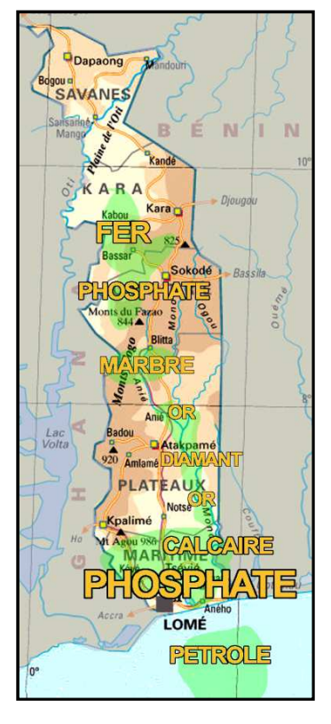
Main extractive reserves of Togo

Togo has known a significant development of mining exploration and production works since the 1960s. In 2011, mining production of the country mainly consisted of about 860,000 tons of phosphate<sup>9</sup> (14<sup>th</sup> in the world ranking) and 1,700,000 tons of