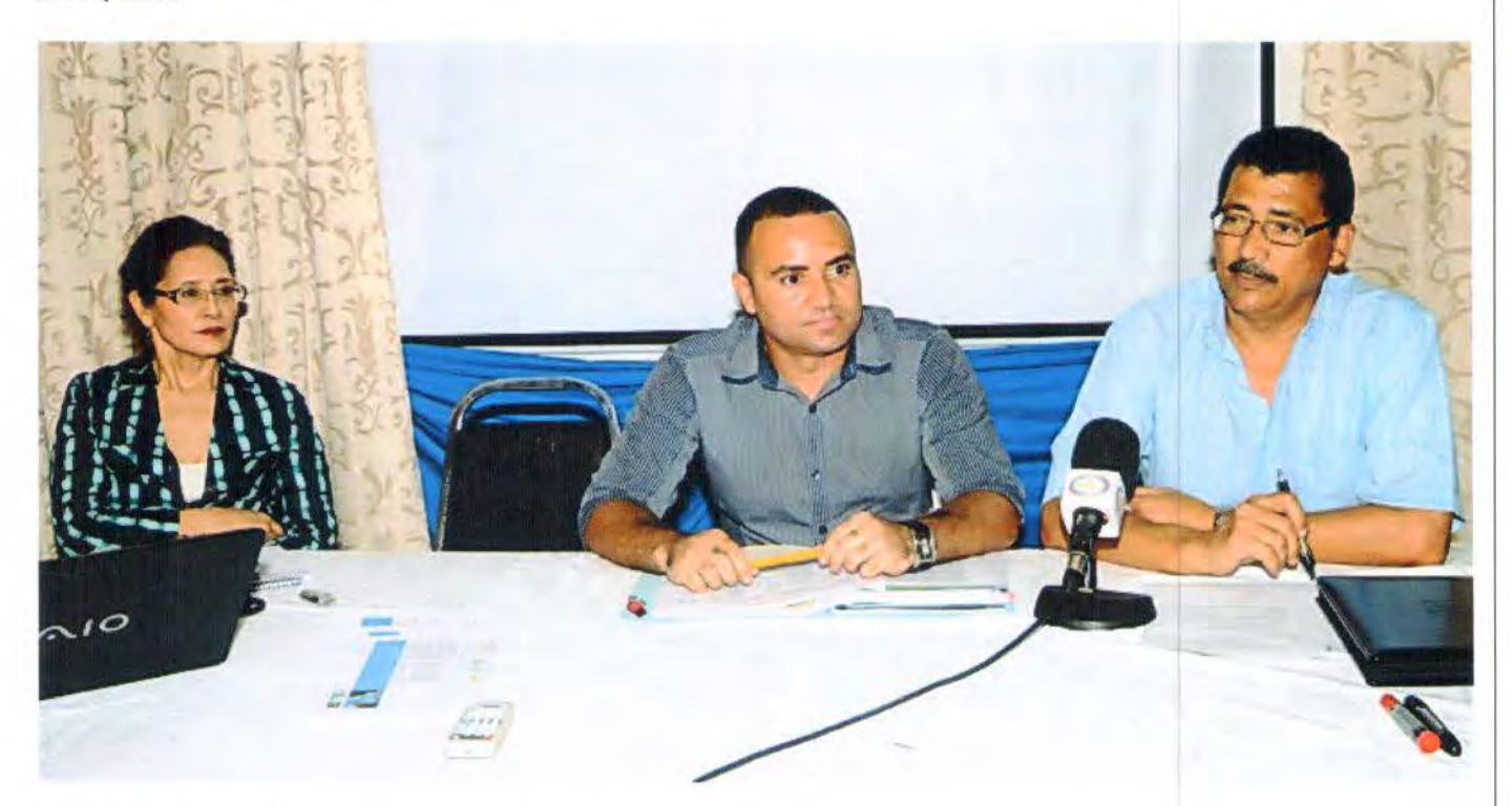
The multi-stakeholders committee meeting in progress