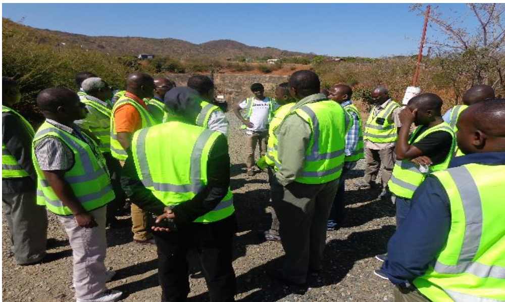
Picture: The Zambia EITI during a mine visit in 2014

During the year under review, the ZEITI Secretariat managed to collaborate with the mining companies in disseminating the EITI reports. The mining companies disseminated the EITI report in various media at their own cost. This is indication of the value that the mining industry has on the EITI process. It is hoped that the ZEITI Secretariat will leverage on this goodwill and encourage other mining companies to actively participate in the dissemination of the EITI reports.