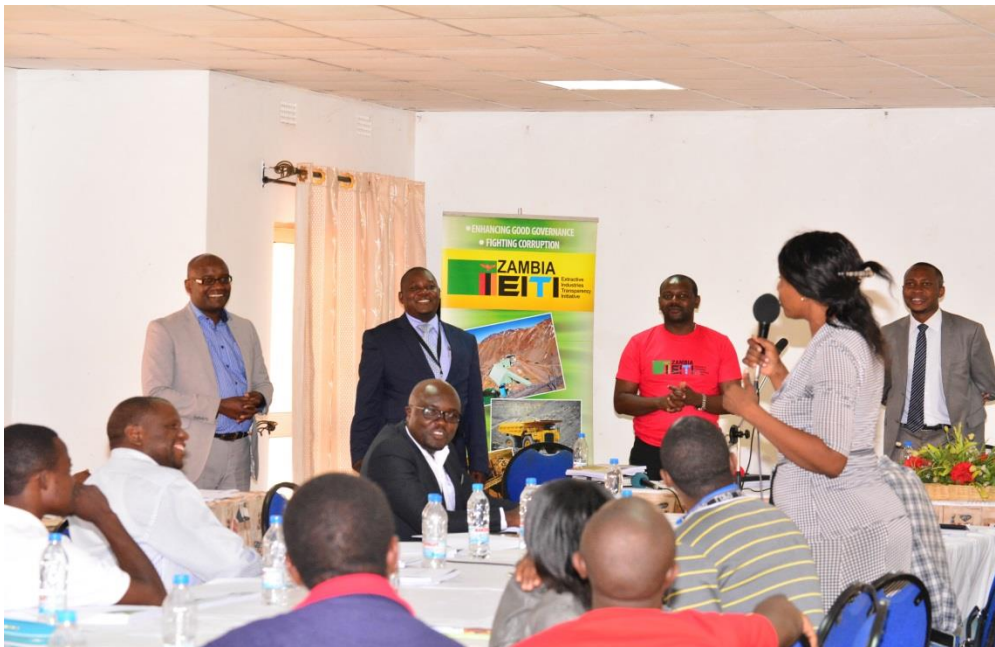
Picture: A Zambia EITI dissemination workshop underway in Livingstone

ZEITI conducted television, radio and print-based discussions on the findings of the 2011 reconciliation report. The 2012 and 2013 Reconciliation reports were extensively published in the both private and state newspapers. In addition, we produced branding materials such as t-shirts, caps and pens for the Zambia EITI to be used during the community engagements and dissemination of the Reconciliation reports