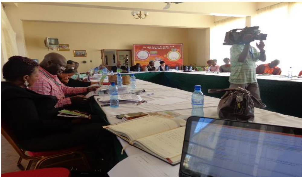
Picture: A workshop with the mining companies underway in Kitwe

In order to address the issues of outdated reports and delays in procurement of consultants, ZEITI decided to engage one consultant to produce both the 2012 and 2013 EITI reports. Moore Stephen LLP a firm based in the United Kingdom was contracted as Independent Administrator as they had an established track record of producing quality EITIs not only for Zambia but across the globe.