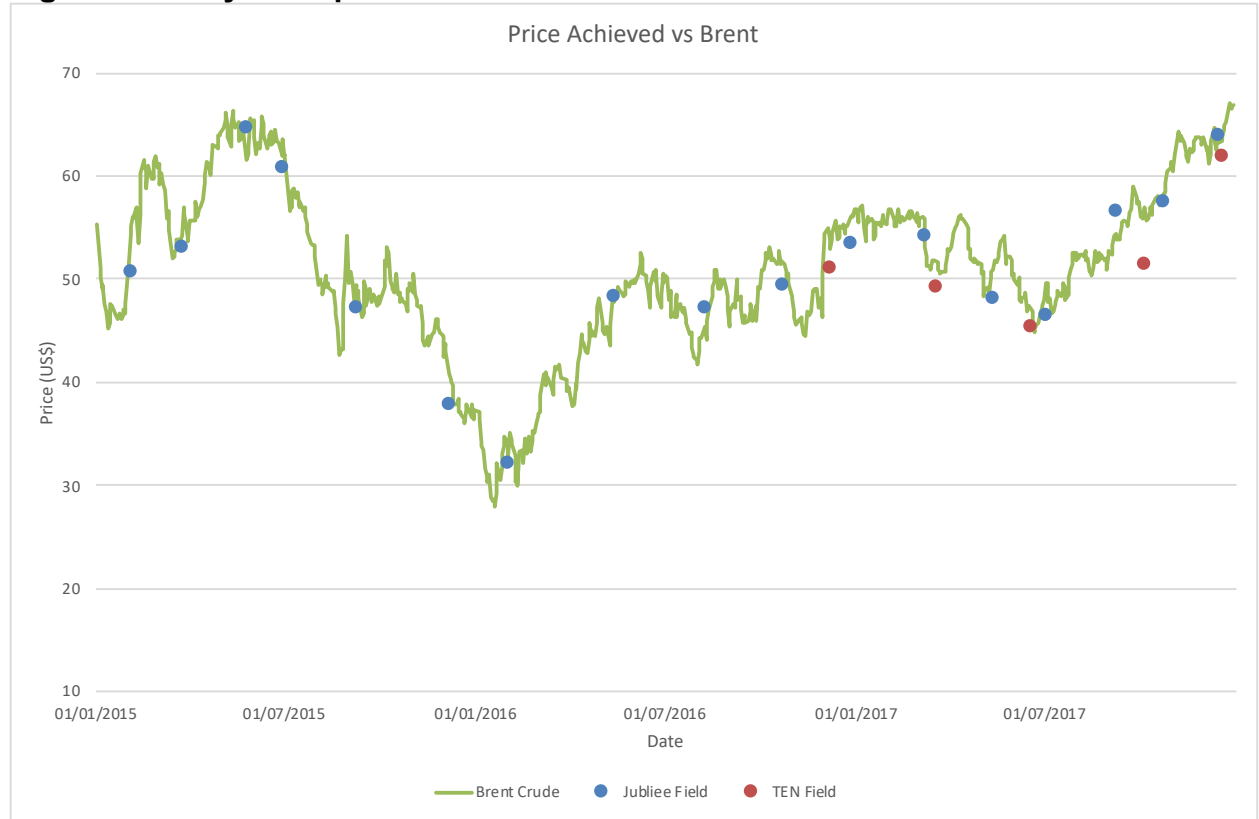
Figure 2: Analysis of price achieved vs Brent

The prices achieved for oil sales during the period fluctuated, and are shown here in comparison to the Brent benchmark (see Figure 2). It should be noted that there is a reasonably close correlation between the prices obtained by GNPC for oil from both the Jubilee and TEN fields, and the prevailing Brent price. Indeed, during 2015 and 2016 the prices appear to match almost exactly. During 2017 there is more variation, which could be the result of a number of factors: