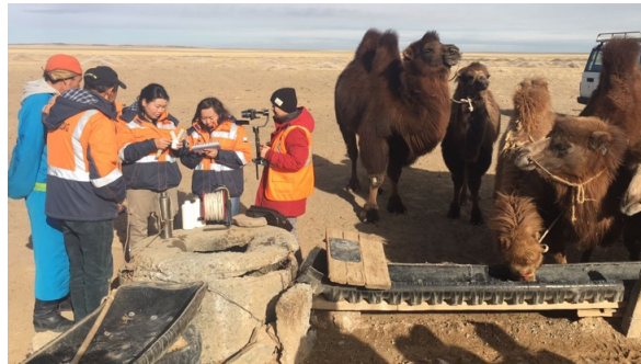
Mongolia: Water Stewardship