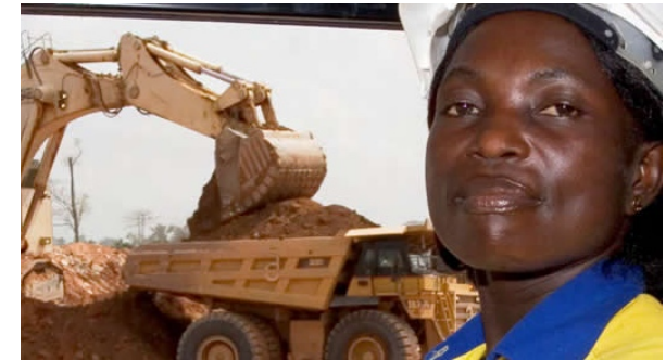
Ghana: Local Economic Development