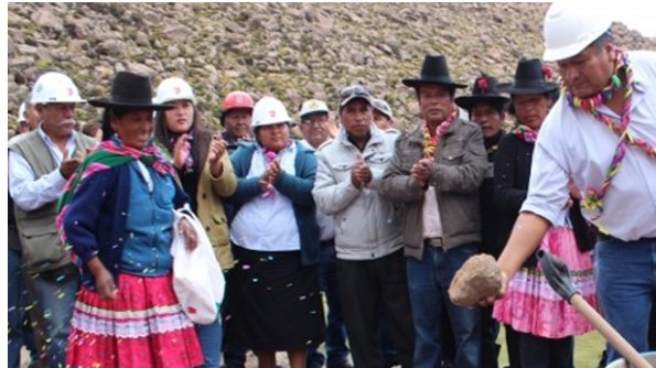
Peru/Colombia: Revenue Management