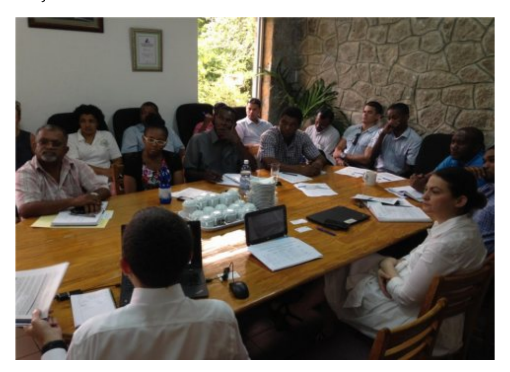
Training with Technical Staff and Senior officers from the Ministry of Environment, Energy and Climate Change and PetroSeychelles