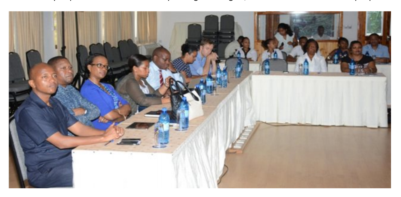
Tanzanian team and Seychelles Civil Society attending the workshop