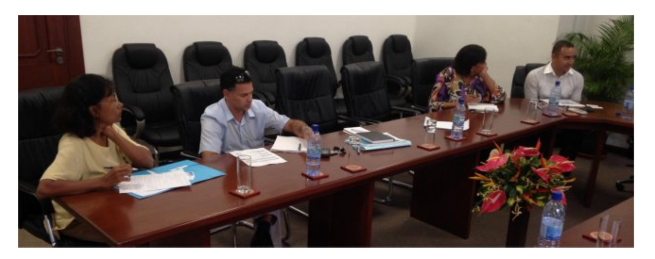
Some members of the Seychelles Multi-Stakeholder Group