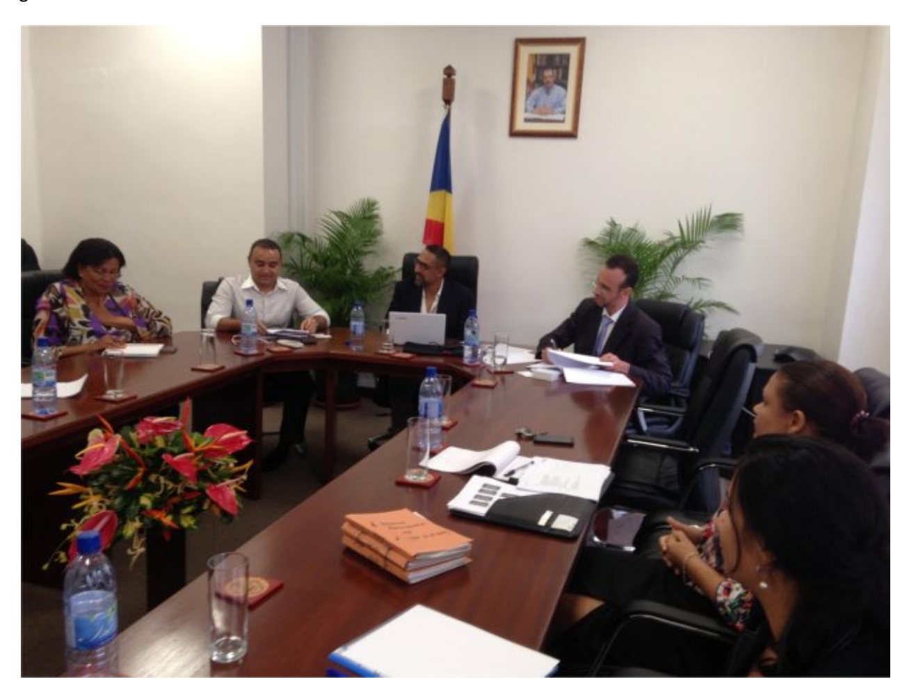
MSG and Independent Administrator at the end of the Mission meeting

<u>Outstanding</u>: At the end of the Mission, two of the reporting Government entities: Ministry of Finance, Trade and the Blue Economy (MFTBE) and the Seychelles Revenue Commission promised to get the Certification of the audited accounts from the Auditor General which was achieved in 2016.