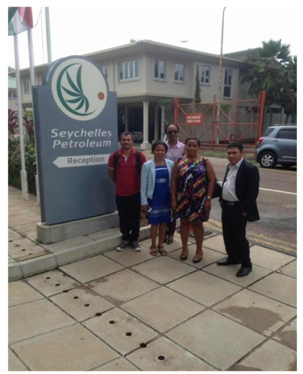
East Timor and Tanzania Delegations visiting the Seychelles Petroleum Corporation