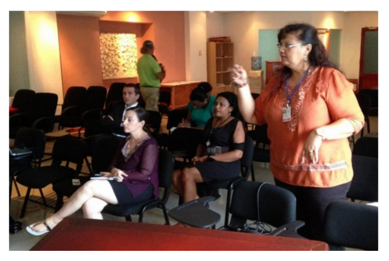
Meeting with local journalists/media houses