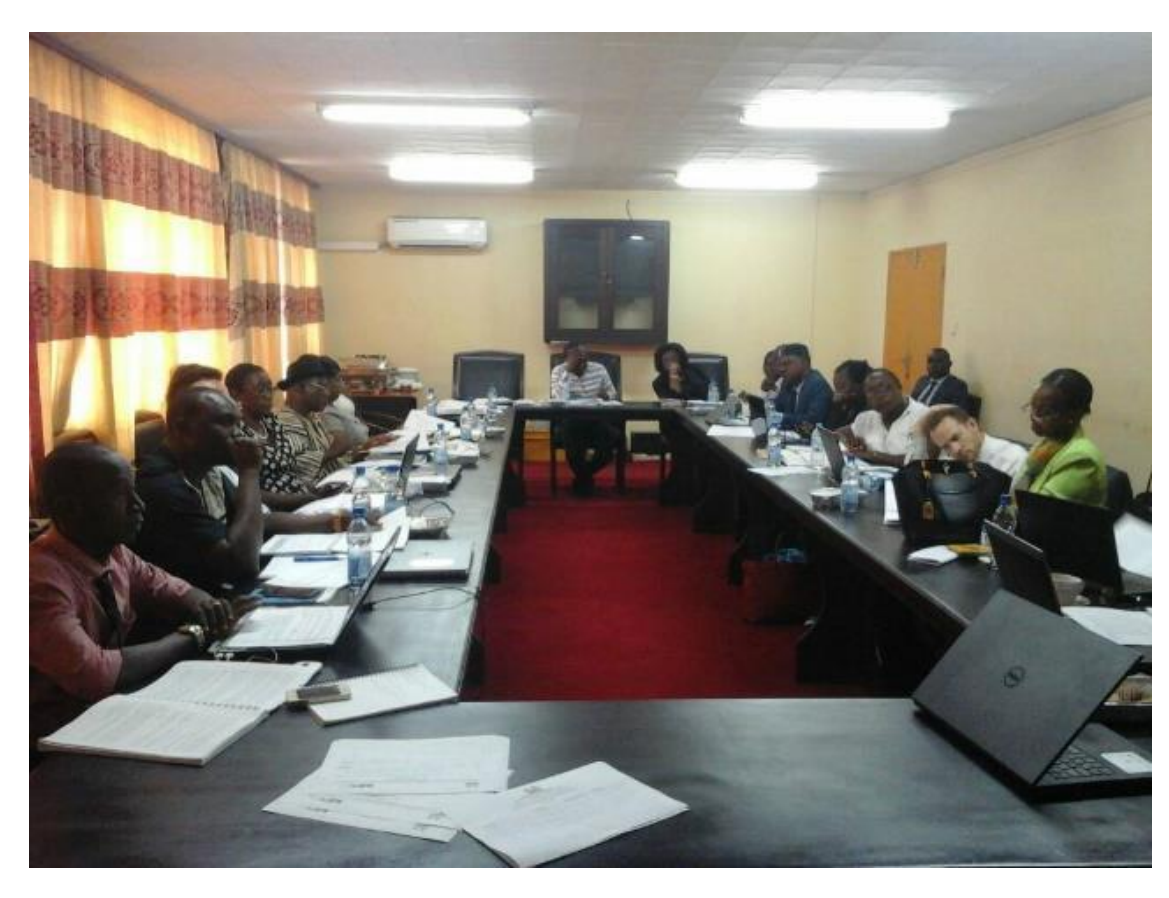
SLEITI MSG and MMMR officials discussing the 2017 Minerals Policy

On Thursday 18th May 2017, the SLEITI MSG attended a meeting with MMMR Permanent Secretary, Policy Adviser and other senior representatives from the Ministry to discuss and suggest revisions into the draft Minerals Policy with a view to strengthening the transparency and accountability provisions. According to the Ministry of Mines, the rationale behind the new policy is to more comprehensively reflect the role expected of the sector as driver of economic growth and to capture global and regional trends in the minerals sector.